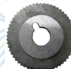
MCT55 Feed wheel