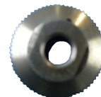
CSW109 Feed wheel