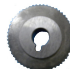
ROS24 Feed wheel