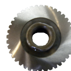
CSW106 Round cutting blade