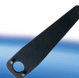
MC4T Blade's wrench for MC4, CC11 & Rodi 61