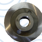
BEU70 Round cutting blade