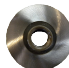
FP102 Round cutting blade