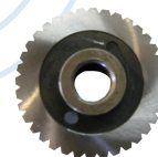
ROS17 Round cutting blade