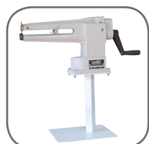
SKU: CC11 STAND

Optionnal height extender base is available.