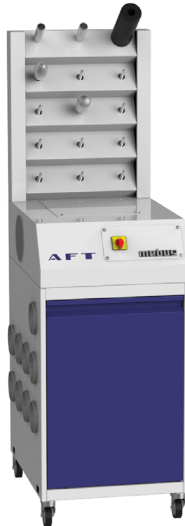
MAS150 with tool holder, SKU: MOBILE150MOBILE