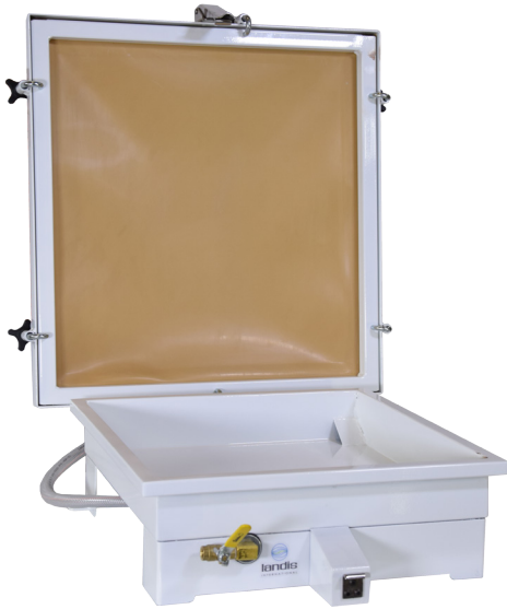
SVP DUAL SKU: SVP1718