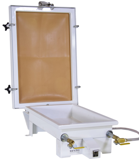
SVP SINGLE SKU: SVP