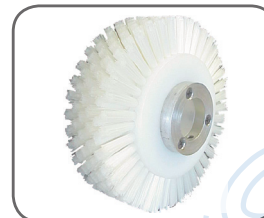
Mud Cleaning Wheel Cleaning wheel removes caked mud without damaging soles or cleats SKU: 646N