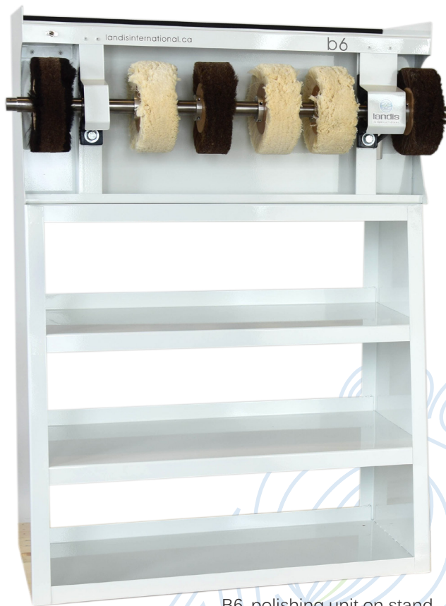
B6, polishing unit on stand SKU: SUPREMEB6

Perfectly Suited for Hotels, Locker Rooms or Golf Clubs and Shoe Repair Workshop