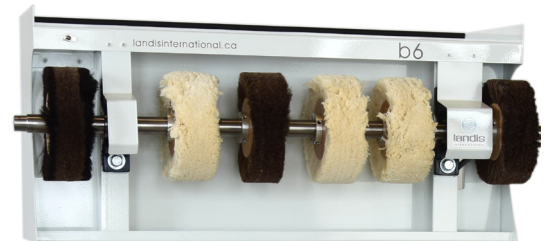
B6B, Bench top model SKU: SUPREMEB6B